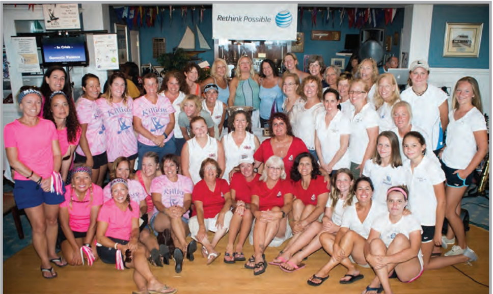
2016 Ms. Racers